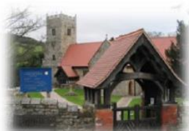
St Mary's Church Selattyn, nr Oswestry