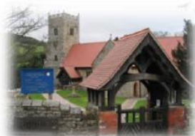
St Mary's Church Selattyn, nr Oswestry